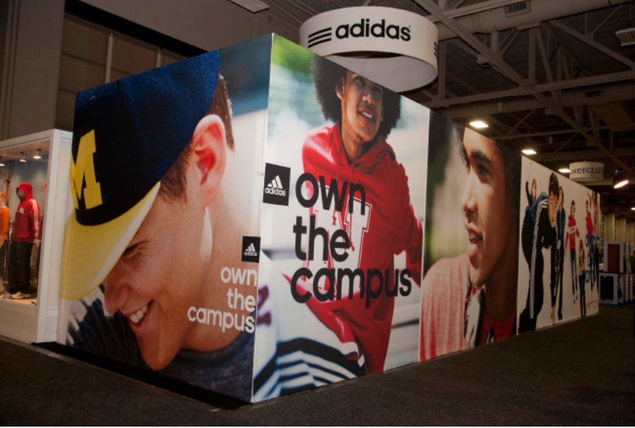
Exhibit & Retail